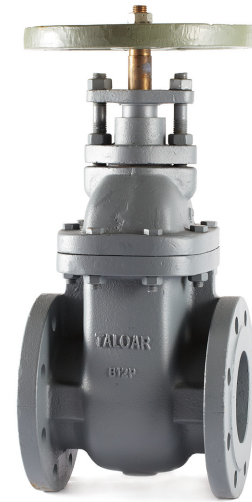
MG670-N 2" - 24"